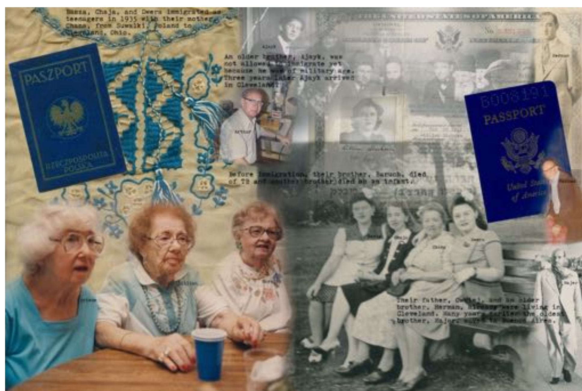
Gail Rebhan, Dyszman/Dishman , 2017. Archival pigment print mounted on aluminum, 18 x 26 inches.

Posted on February 8, 2023 Written by Taya Zoormandan